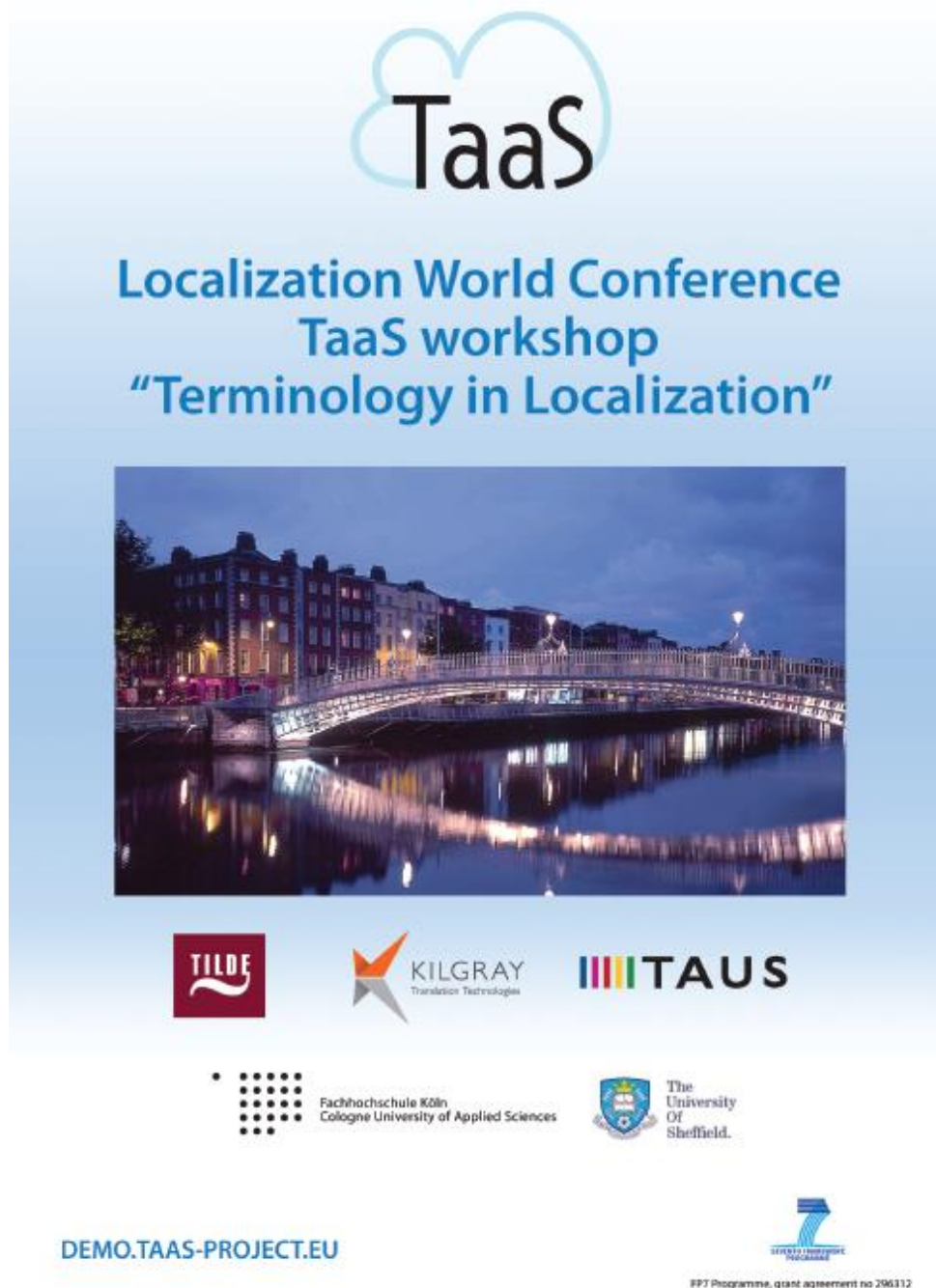
Figure 5. TaaS Workshop 2 poster

Prior to TAUS TaaS Workshop, we designed a digital poster to promote the event in our online communications (see in D5.7 Final leaflet and poster). We also produced an A4 version of the poster for distribution during the LREC 2014 conference on 26-31 May 2014 where the TaaS project would participate in the EU Project Village and pre- and post-conference workshops (see Figure 5).