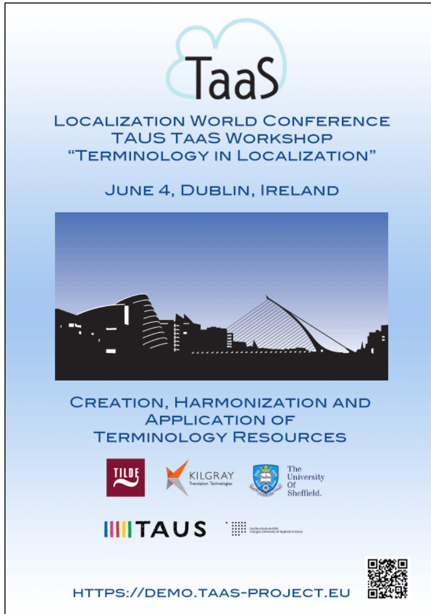
Figure 5. TaaS Workshop 2 digital poster