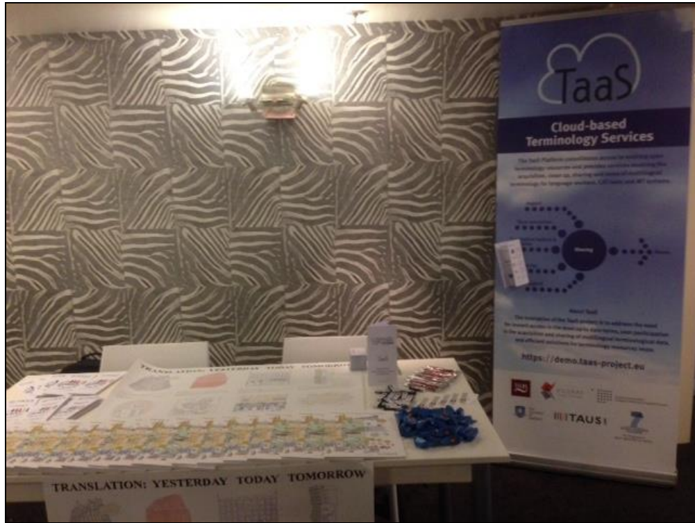
Figure 3. TaaS Banner at OCPE in Utrecht, the Netherlands, 4 April 2014