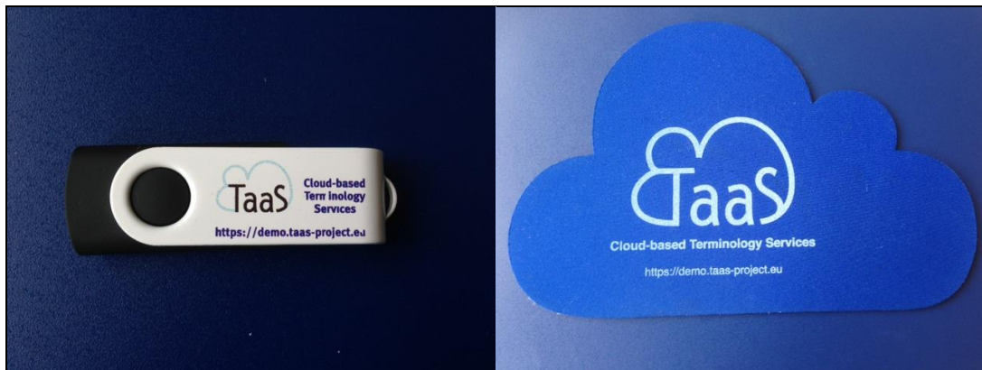
Figure 4. TaaS Promo materials

Prior to the TaaS Workshop 2 (TAUS TaaS Workshop) in Dublin we designed a digital poster for the event promotion. The digital poster was used in our communication campaigns, social media, and on the project website to inform the industry peers about the TaaS event and to attract the potential users of the TaaS platform (see Figure 5).